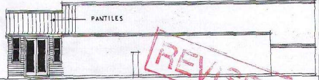
REAR ELEVATION -> NORTH WEST