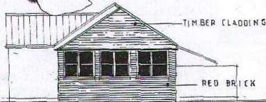
SIDE ELEVATION -> NORTH EAST